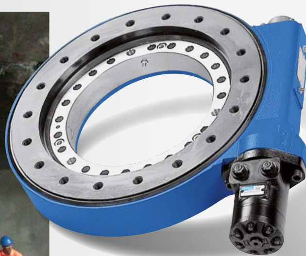
Slew drive in the WD-L range for a special device for insertion of wall reinforcement